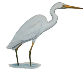
Eastern Great Egret

Look for Eastern Reef Egret, Caspian Tern and Great Egret near the river mouth. Pied Cormorants roost along the river.